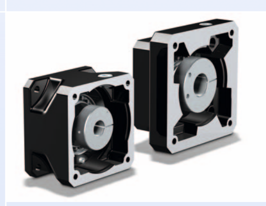
Example motor adapter ME 30: Left-hand version for 145 mm square motor rating plate, Right-hand version for next standard size 190 mm