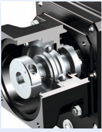
All ME motor adapters are fitted with an EasyAdapt® coupling for quick attachment. For easy detachment of the coupling, the threaded clamp has an expanding function (expansion bolt). Optional "Longlife" oil seal for extreme re-