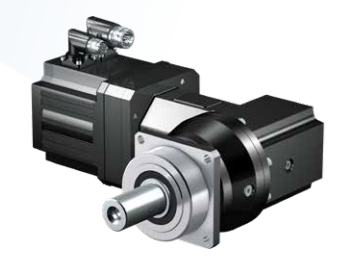
PKX, PK Right-Angle Planetary Geared Motors

Quattro power for small installation spaces.