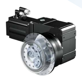
PHKX, PHK, PHQK Right-Angle Planetary Geared Motors

Contact us: +49 7231 582-3060 | systemsupport@stoeber.de