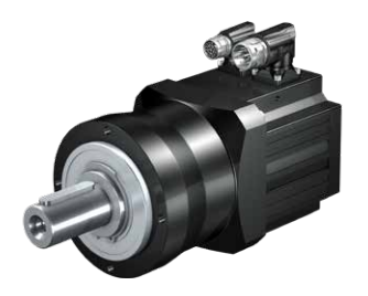
PE Planetary Geared Motor

Quattro power for maximum power density.