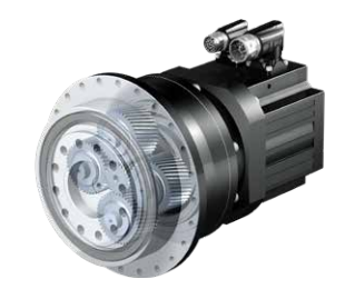
PH, PHQ, PHV Planetary Geared Motors

For high precision and smooth operation.